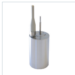
NanoVACQ 1Tc FullRadio, standard antenna