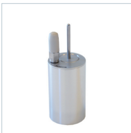
NanoVACQ 1Tc FullRadio, short antenna