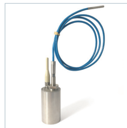
NanoVACQ 1Td FullRadio with Teflon® PFA probe