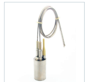
NanoVACQ 2Td FullRadio with semi-rigid probes