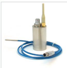
NanoVACQ 1Tdi with connector Fischer Connectors® and connectable Teflon® PFA probe