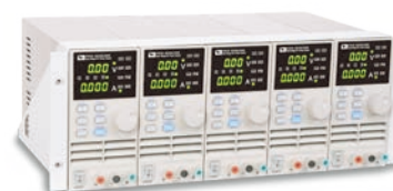
IT-E152 19" Rack Mount Diagram