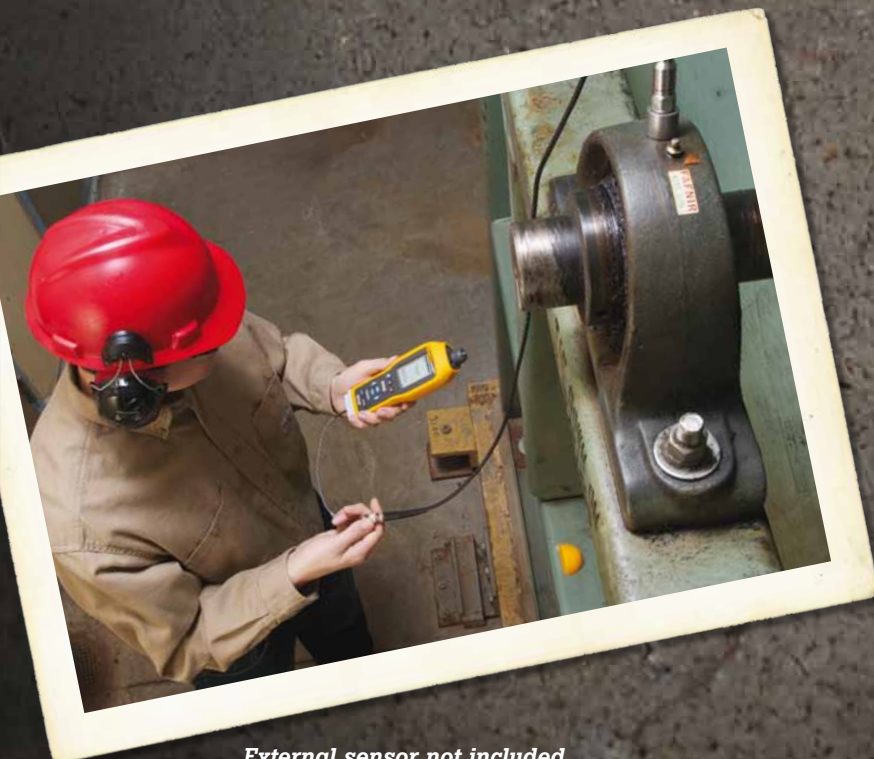
External sensor not included

Via Acquanera, 29 22100 COMO tel. 031.526.566 (r.a.) fax 031.507.984 info@calpower.it www.caltower.it