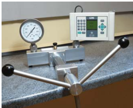
Pressure comparison pump LSP 1000-LC

In "measuring" operation, the LPC 300 displays simultaneous: