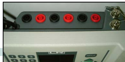
LPC 300 electr. measurement plugs voltage & current input, voltage output, pressure switch, USB/RS232, battery charger