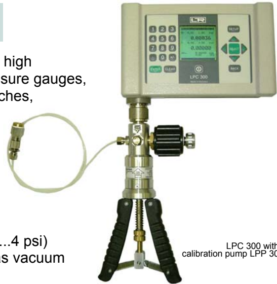
LPC 300 with calibration pump LPP 30