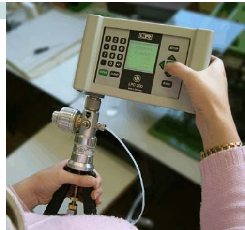
LPC 300 with calibration pump LPP 30 "on site"