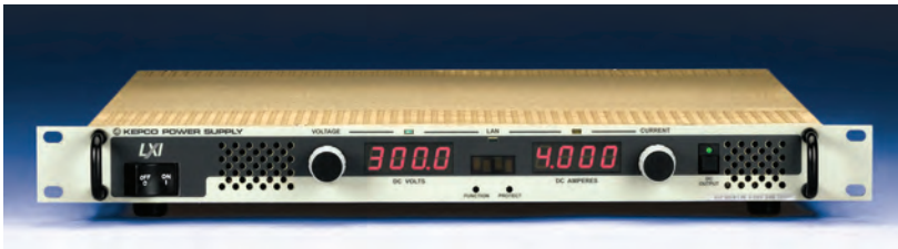
KLP MODEL TABLE