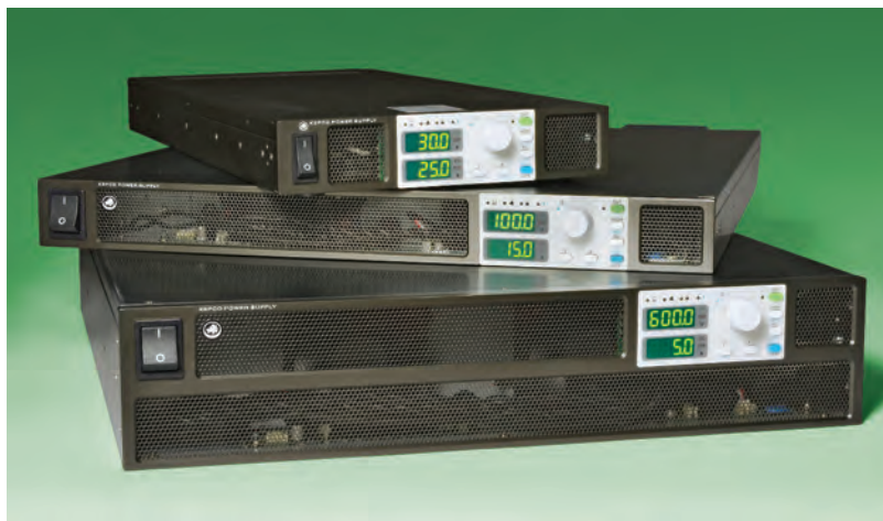
KLN Series Programmable Power Supply: 750W 1U, Half-Rack (top), 1500W 1U, Full Rack (middle), 3000W 2U, Full Rack (bottom)

Precise programming of voltage, current and their limits may be achieved from the front panel, or by analog means or by RS 485 digital control. GPIB or LAN interfaces are factory-installed options.