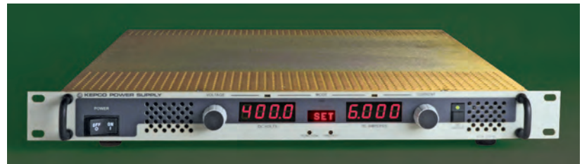
KLR MODEL TABLE