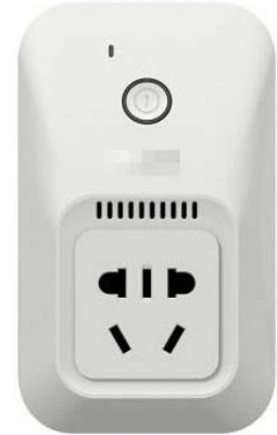
Figure 1 Smart socket

With the rapid development of the Internet of Things Industry, more and more intelligent devices come into our daily life. Smart socket is a typical sample, that it realizes the function control by phone App with the built-in Wi-Fi module. Most of the smart sockets in the market emphasize their intelligent functions on household. With the trends of energy-saving, the standby power consumption of home appliances is the basis of utilizing value. For example, the standby power of a LCD TV is 8.07W, it is 70.69kW/h for one year, and about ¥40.00 is wasted. Never overlook the standby power consumption of electrical appliances. Today, ITECH select a well-known brand smart socket randomly from the market and test the standby power consumption.