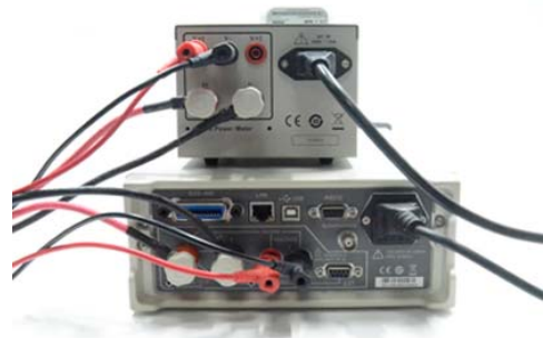
Figure2 Wiring Diagram of ITECH Evaluation

Put the smart socket into the test fixture, simply open the power switch of the smart socket (power indicator is red). As the main purpose of this test is to test the standby power consumption, no need to connect with any external electrical devices.