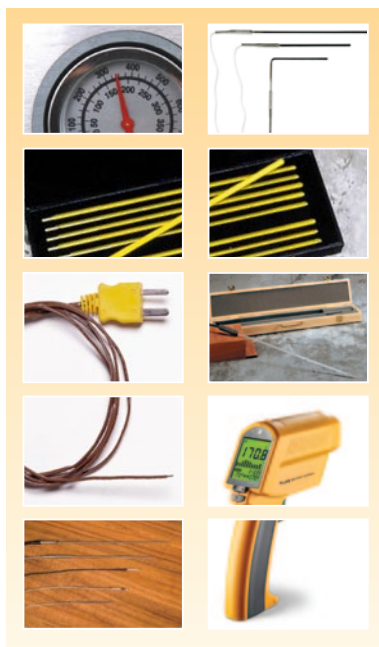
Table 1. Common thermometers that need to be calibrated