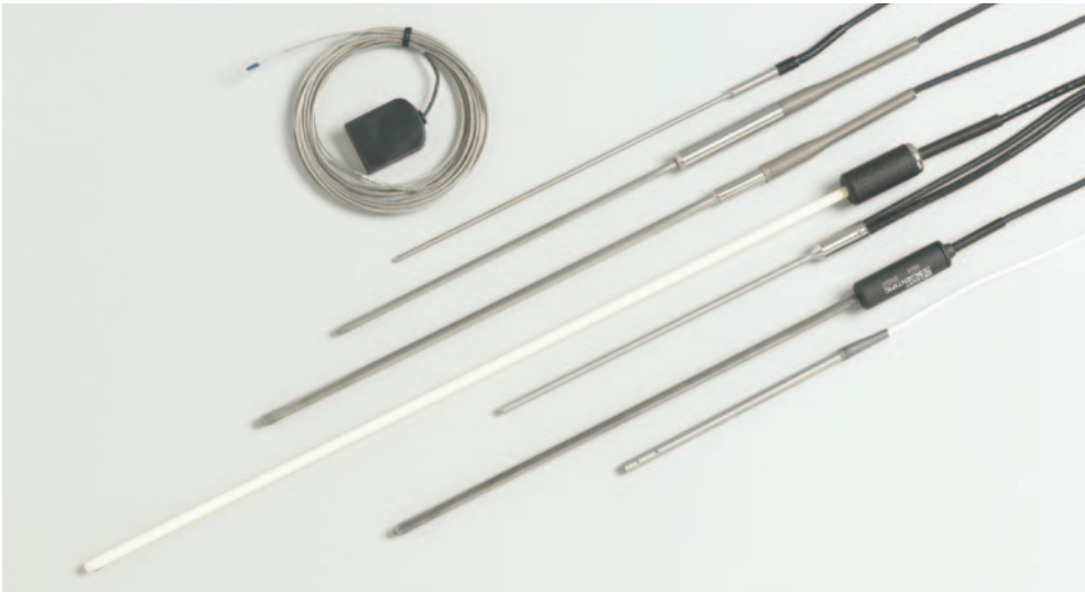
Caption to go here