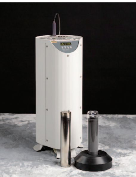
Table 5. ITS-90 fixed point calibration equipment